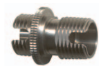
Industrial and Fiber Optics