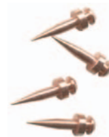
Instrumentation & Gauges